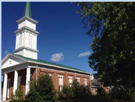
CRANSTON MEMORIAL PRESBYTERIAN CHURCH Built in 1856

Come join us each Sunday for our services and fellowship!