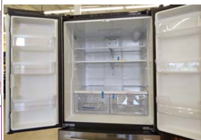
This "French door" unit has very wide shelves that will be useful for trays and platters. It is substantially bigger than the old unit.

Session recently approved the serving of COMMUNION on the first Sunday of each month. A new refrigerator was purchased and installed in August.